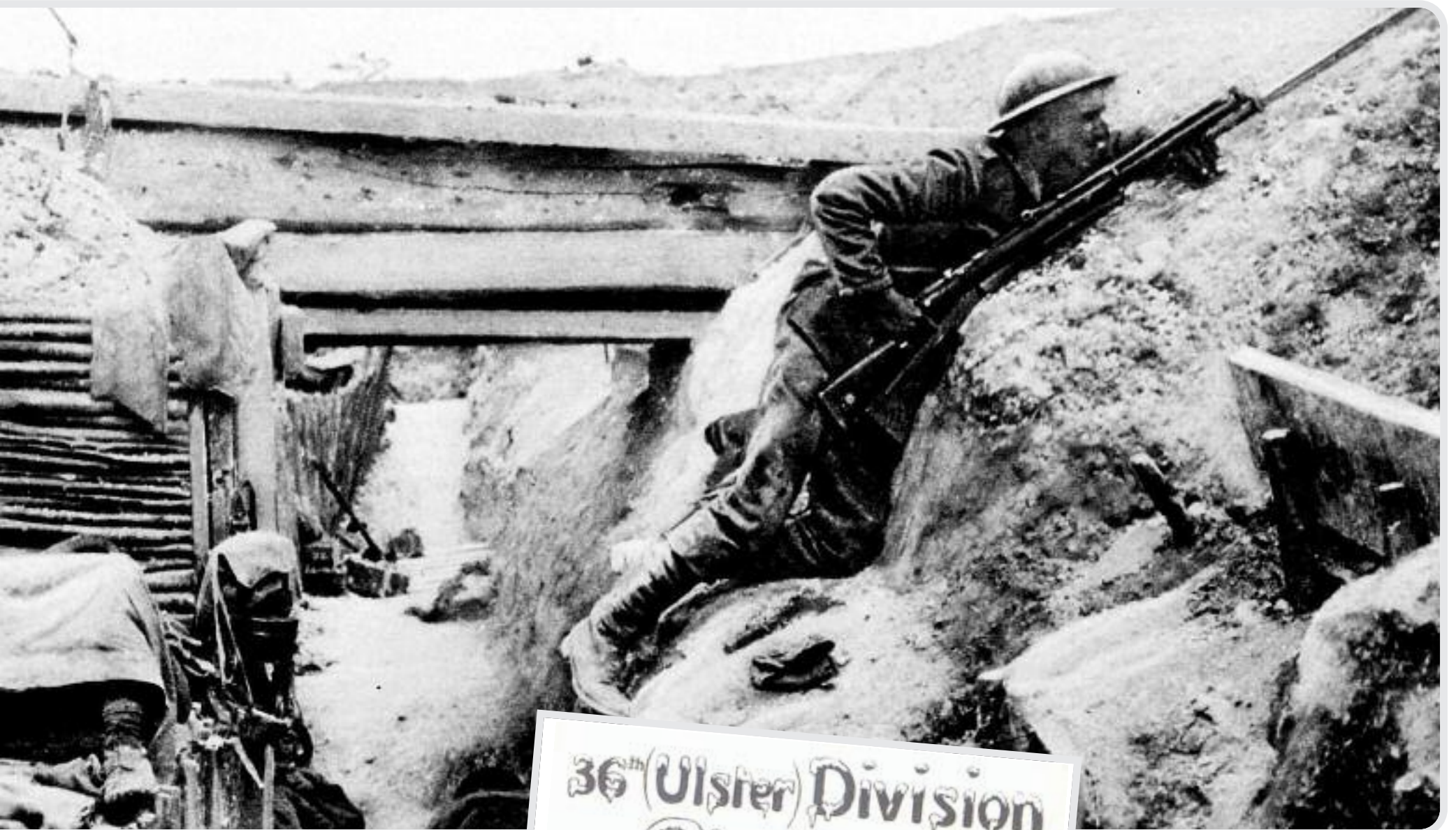
over his trench as comrades sleep

staff officer Divisions. n the e an d staff was nd th two ted that if ce to record portunity d in 1922, monds, Military perial place on his and i. red the ampaigns edonia, as ne German and the Captain y which he ator for 15 World War ormed